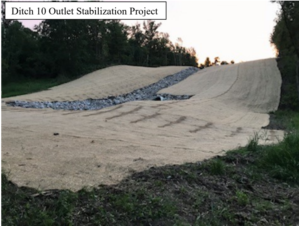
Ditch 10 Outlet Stabilization Project

Construction of the Ditch 10 outlet stabilization project was completed. Progress was made in designing and planning the Demarais-Hanson erosion control project.