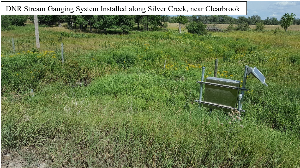
DNR Stream Gauging System Installed along Silver Creek, near Clearbrook

Discrete (manual) water quality measurements were collected at the beginning, near the middle, and at the end of each deployment. At the end of each deployment period, a freshly calibrated logger was deployed to replace the recently deployed logger. After retrieval loggers were cleaned and re-calibrated in the District's laboratory. Quality assurance measurements were recorded to determine the extent of drift or calibration corrections. The quality assurance measurements are used to calculate any calibration/fouling drift corrections that are needed. Software is used to apply necessary drift corrections and compare logger data to discrete measurements.